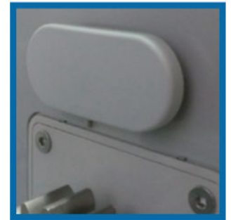
Magnetic Limit Switch (Optional)