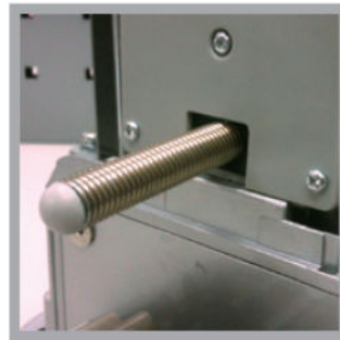
Spring Limit Switch