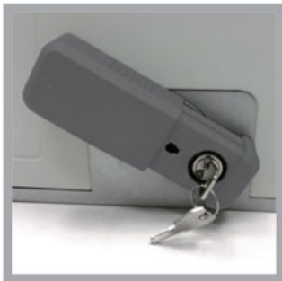
Quick Release Device